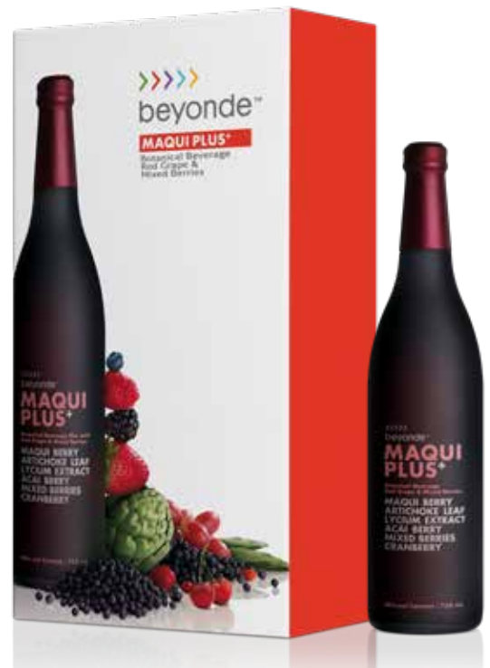
Duo (2 Bottles) Pack