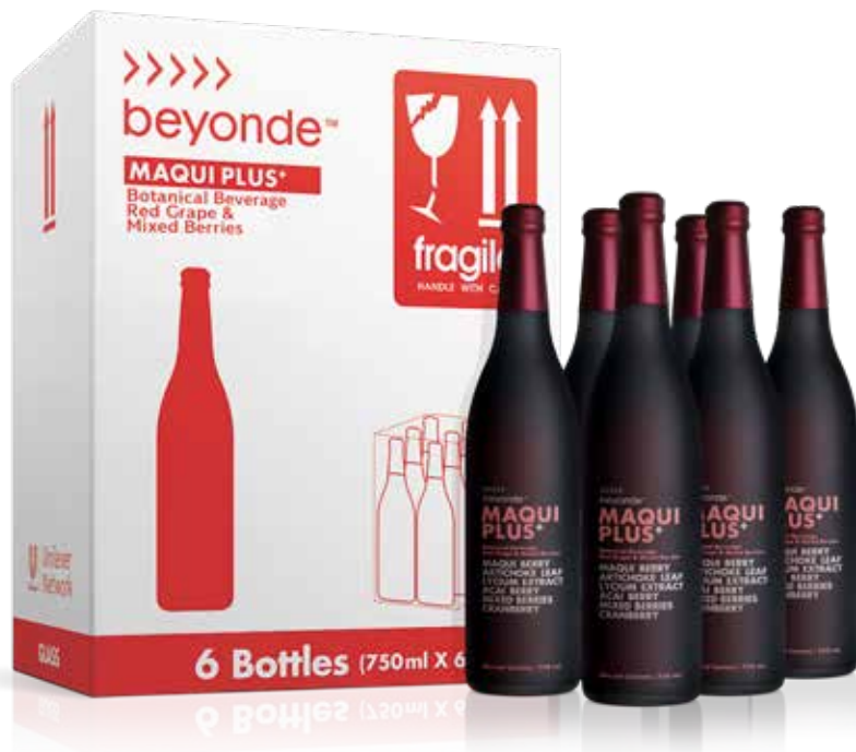
1 case (6 Bottles) Pack

* Skor ORAC (mikromolTE/100gm) pada volum sama, 750 ml. Dikendalikan oleh Brunswick Lab, USA.